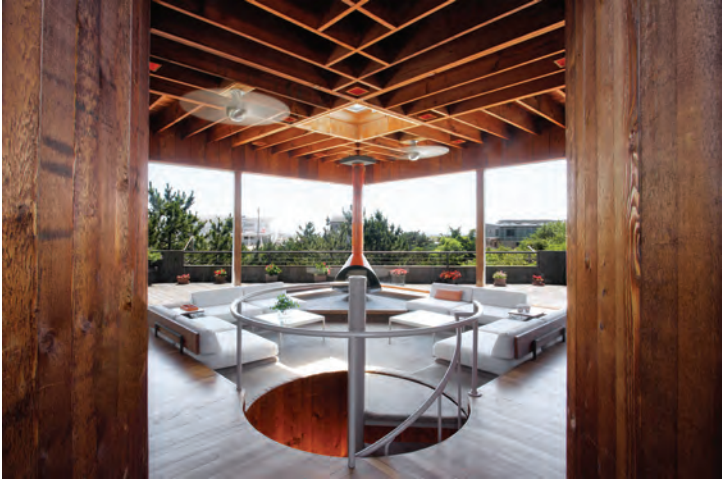
Rosenthal House (Horace Gifford, architect), 1972, Seaview, Fire Island, NY. From the 2013 Graham Foundation Individual Grant to Christopher Rawlins for Fire Island Modernist: Horace Gifford and the Architecture of Seduction.