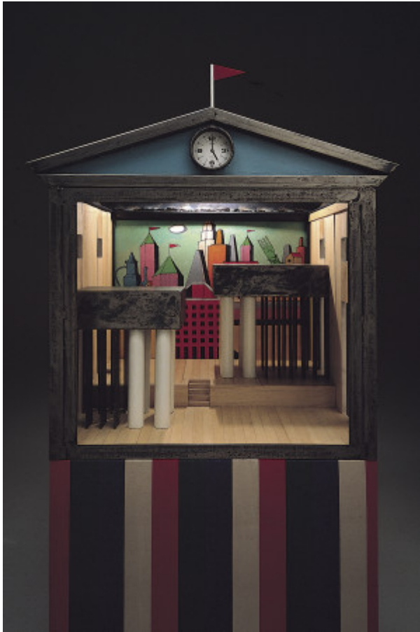
Courtesy of the Fondazione Rossi. Aldo Rossi, "Teatrino Scientifico, Scena con Cabine," 1978.

apparatus to explore the complex interaction between pictorial representation and three-dimensional composition,” Estévez and Ickx tell ARCHITECT.