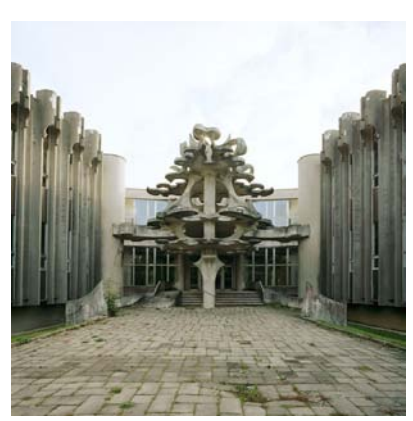
Nicolas Grospierre, Hydroklinika , 2004 D-Print on Wood, 19 3/4" x 19 3/4"