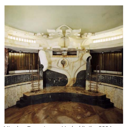
Nicolas Grospierre, Hydroklinika , 2004, D-Print on Wood, 19 3/4" x 19 3/4"

The Graham's exhibition One Thousand Doors, No Exit is the first presentation of TATTARRATTAT and Hydroklinika in the United States. The Graham Foundation's presentation of TATTARRATTAT is made possible in part by the Signum Foundation .